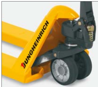
Permanently lubricated connections for maintenance-free operation

The chromed bearing bushes and joints ensure quiet running properties and particularly long service life. It is no longer necessary to lubricate connections; the AM 22 operates like "grease lightning" all the same.