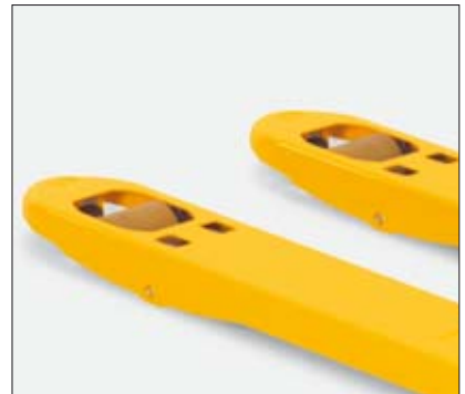
Rounded fork tips for easier pallet entry

Stronger forks. Rounded forms. Welded tiller mounting. Protected entry rollers. More hardened steel. First-rate guarantees for maximum stability and durability. 2200 kg capacity in the basic version speaks for itself!