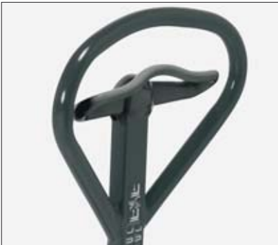
The operating element can be used from any position

The convenient operating element is ideally suitable for both left and right handers. Exceptionally sensitive or proportioned lowering of loads through special lowering valve. The optional fast lift (up to 120 kg) ensures ground-clear lifting of Euro pallets with only three pump actions. The maximum lift height is reached after only five pump actions.